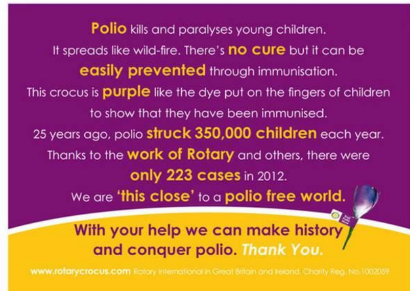
Information Card (back)