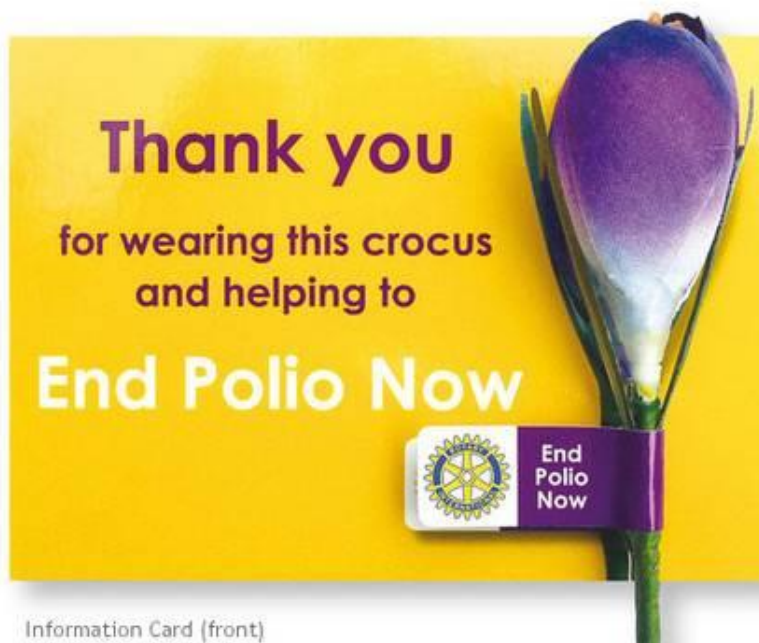
Information Card (front)